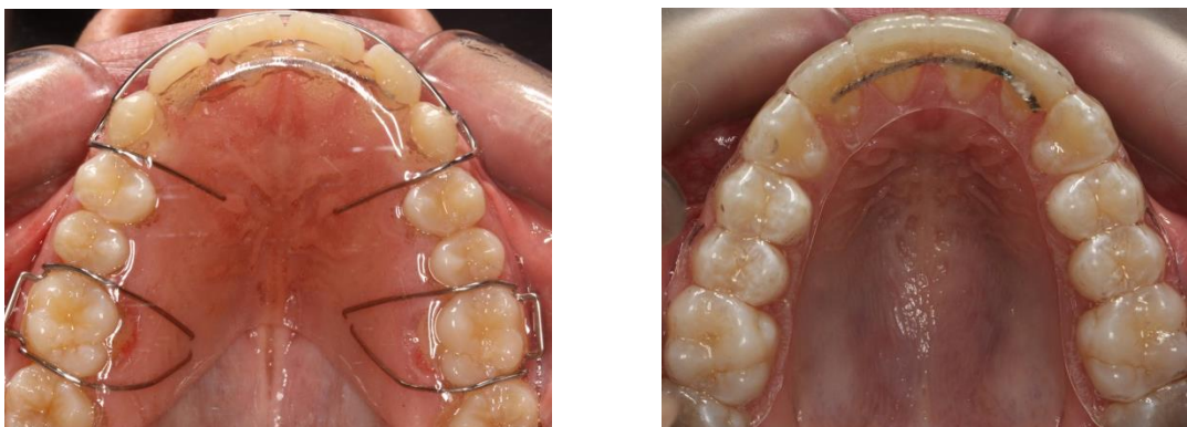
Figure 2: Different types of removable retainer

The removable type are used in most cases, sometimes in combination with the fixed type. We usually ask patients to wear these every night for at least a year after the brace is removed.