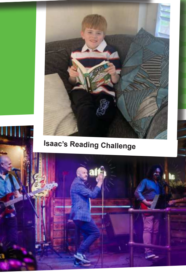
Cherrybomb live at Alta, Whalley