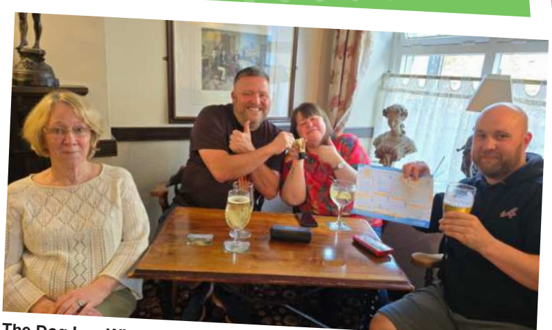
The Dog Inn, Whalley