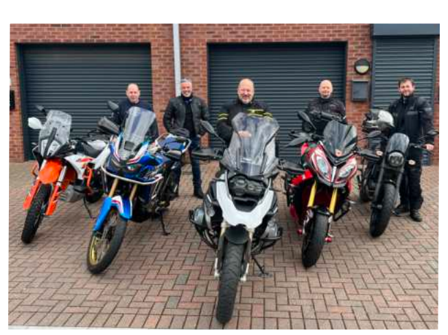
Lands End to John O'Groats in 24 hours