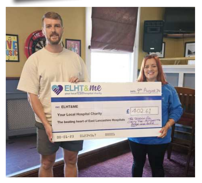
The Station, Cherry Tree