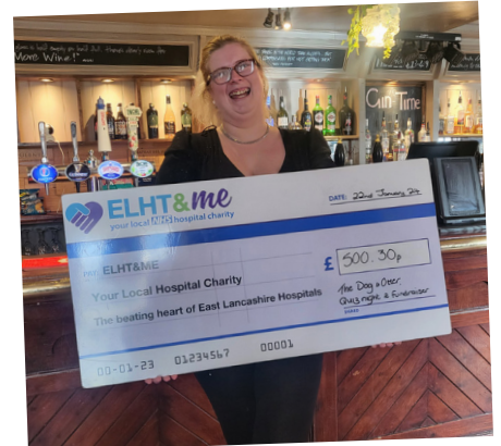
Dog & Otter, Great Harwood