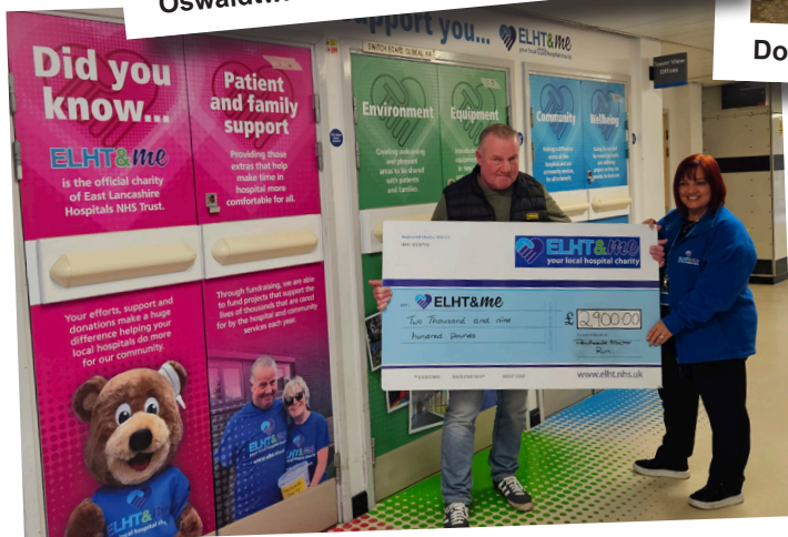
Pendleside Tractor Run