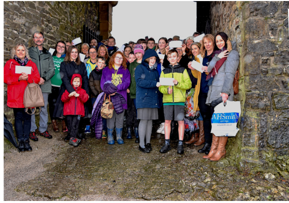
Clitheroe Castle Bonfire Presentation

Your support has made a world of difference, turning ordinary days into extraordinary memories. Thank you for being the 'me' in ELHT&Me.