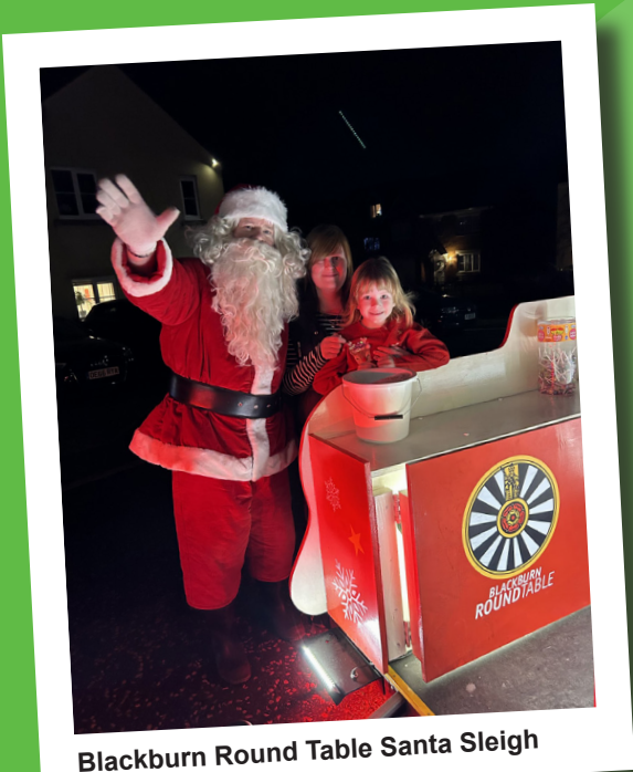
Blackburn Round Table Santa Sleigh