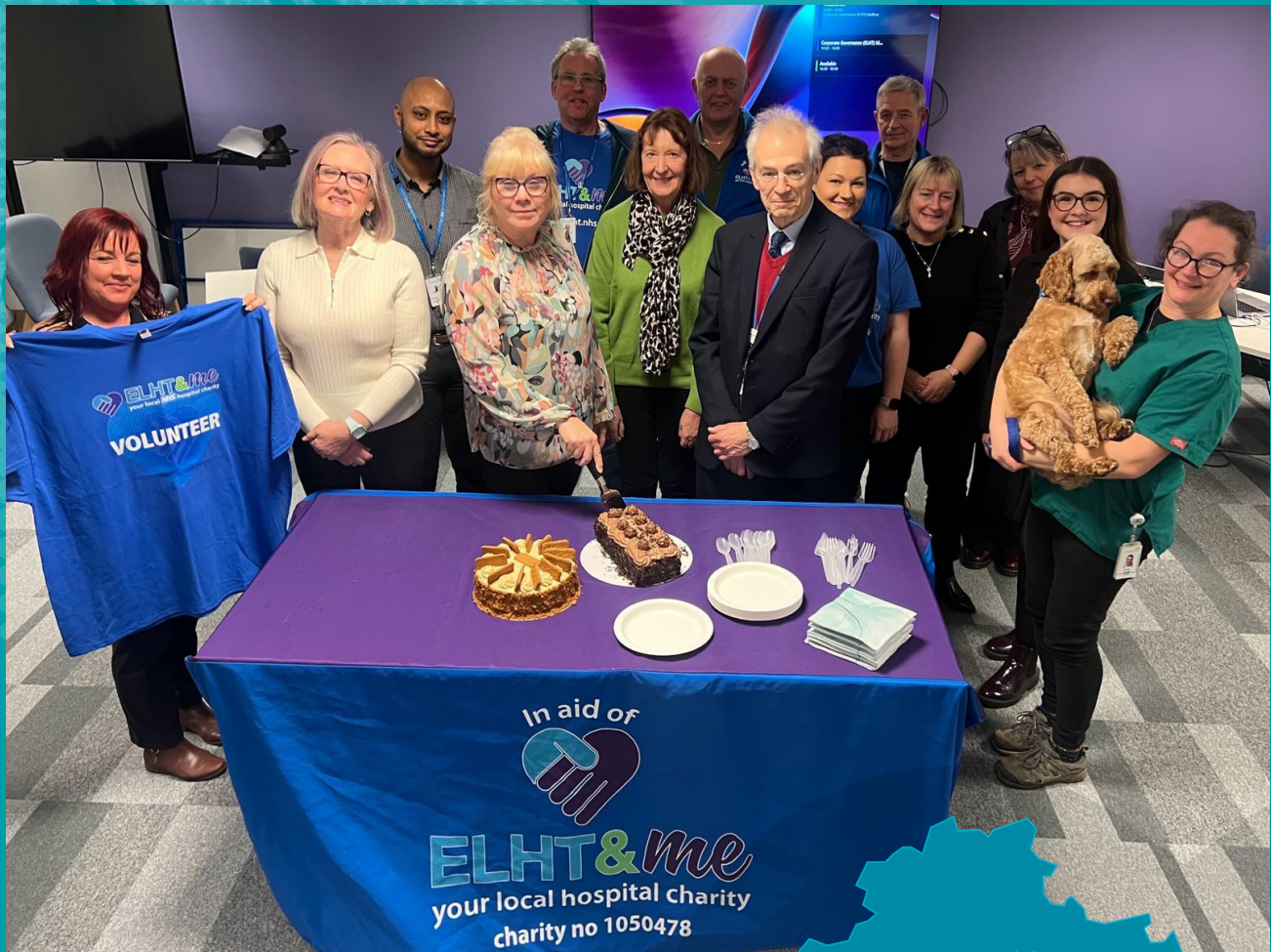
ELHT&Me's recent volunteer recognition event.

Our dedicated volunteers will also be with us at events throughout the year. To see the exciting events we have lined up, please read on to pages 14 and 15.