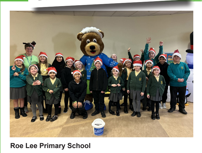
Roe Lee Primary School