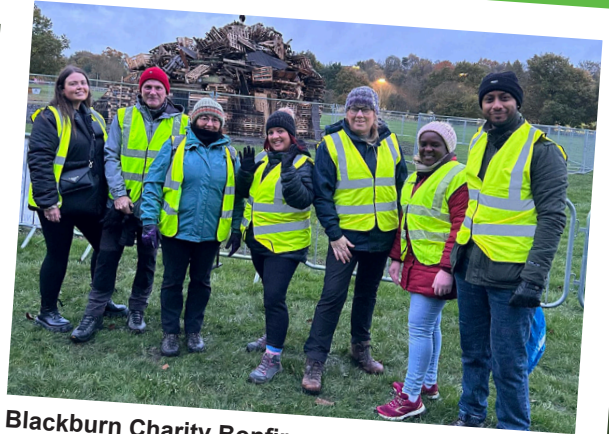
Blackburn Charity Bonfire