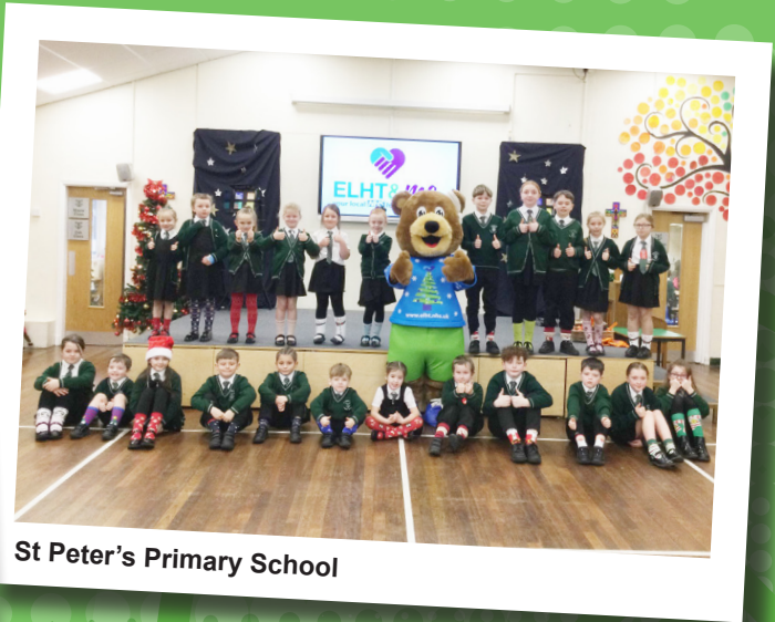
St Peter's Primary School