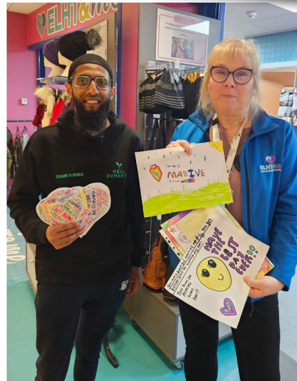
Share A Smile