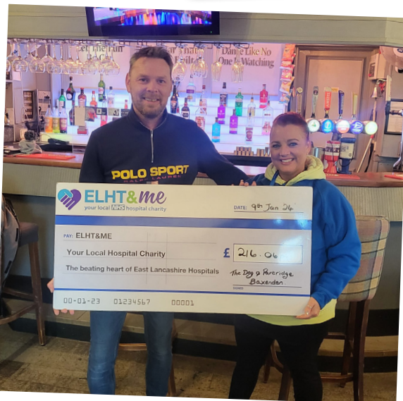
Dog & Partridge, Baxenden