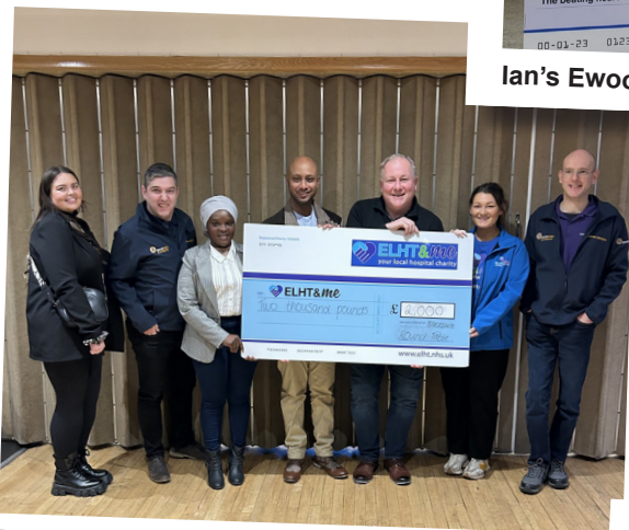
Blackburn Charity Bonfire Cheque Presentation