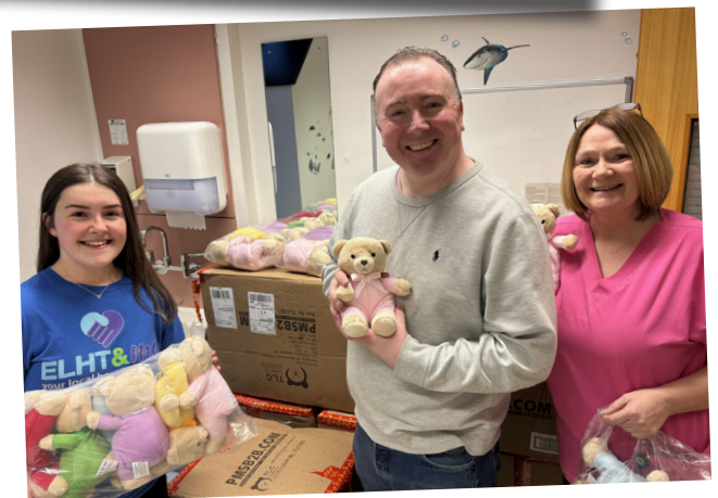
East Lancashire Freemasons