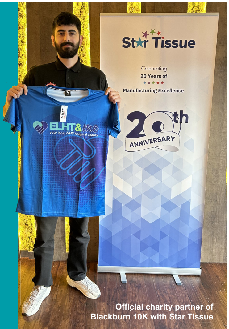
Official charity partner of Blackburn 10K with Star Tissue

Nominating ELHT&Me as your Corporate Charity of the Year partner is a unique opportunity to unite your team behind an inspiring cause and showcase your company's commitment to making a difference. Get in touch to explore how we can work together.