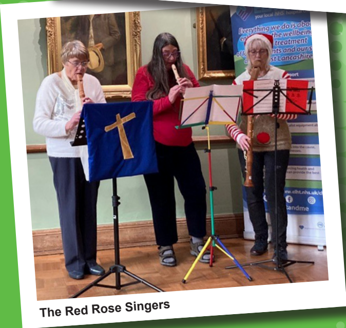
The Red Rose Singers